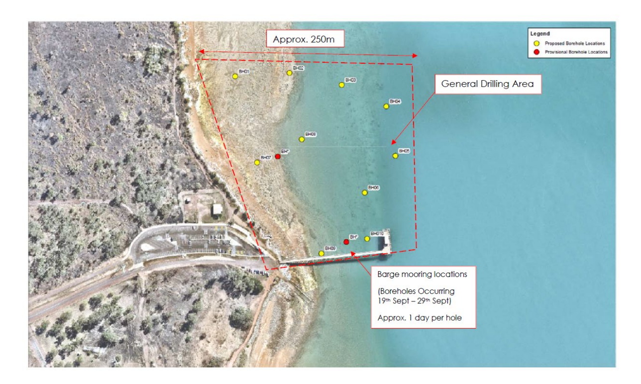
Figure 2: Extent of works around the Jetty.